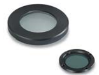
Simple polarising attachment